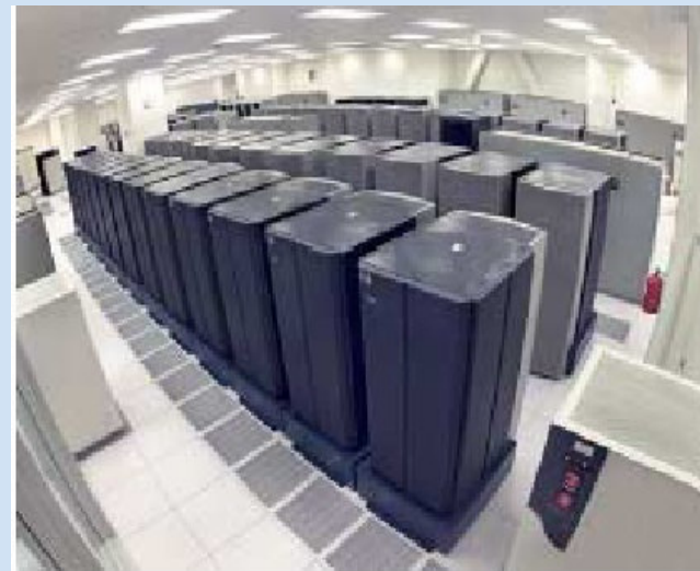
Figure 1 The National Energy Research Scientific Computing Center (NERSC) operated by LBNL